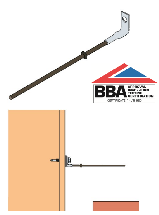
Keep brickwork at least one course clear during installation

The black Ancon Teplo-Clip Insulation Retaining Clip is suitable for use in partial fill cavities with all products in the TeploTie range.