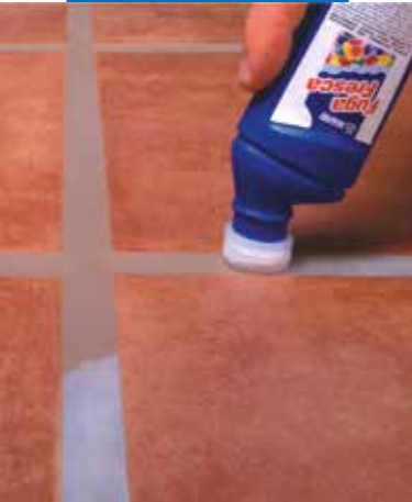
Floor in terracotta treated with Fuga Fresca