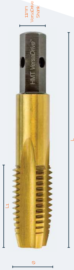
UNC ImpactaTap Sets available from stock