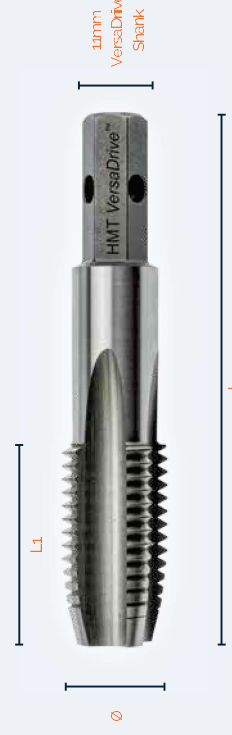
Used for tapping holes used with Galvanised Fixings